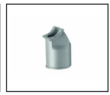
wall holder (galvanized) (314049)