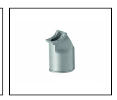
wall holder (galvanized) (314049)