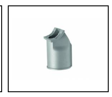
wall holder (galvanized) (314049)