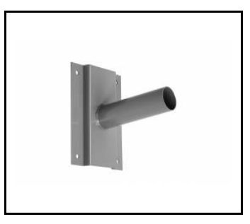
wall holder (grey) (314056)