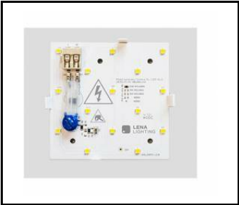
Gamma LED Basic 280 1500lm 840 (13W) - light module (754968)

Card creation date: 07 May 2025 The company reserves the right to make design changes or upgrades in the presented product. Product data sheet does not constitute an offer. * Parameter tolerance is +/- 10%