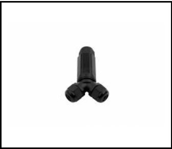
IP68 High-bay PA 6.6 connector black DL06-3A-2Y (800ML208)