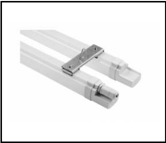
MIMO 2 LED - double handle (set) (100673)