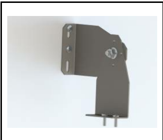
TYTAN LED. ATLAS LED. INDUSTRY LED - adjustable handle (set of 2) (908200)