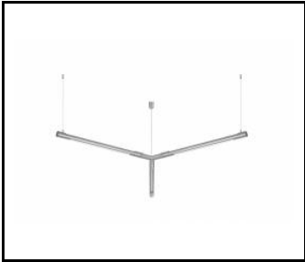
Star connector TUBE LED EVO system (266492)