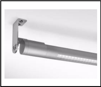
Tube LED EVO surface mounting bracket adjustable +/- 100 degrees (267604)