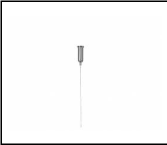
Tube LED EVO suspension cord (266607)