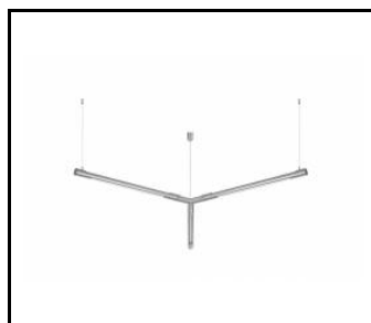
Star connector TUBE LED EVO system (266492)