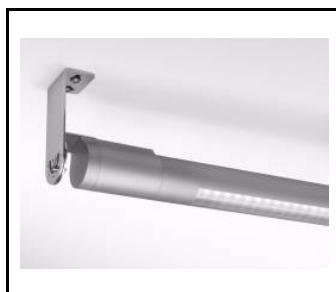
Tube LED EVO surface mounting bracket adjustable +/- 100 degrees (267604)