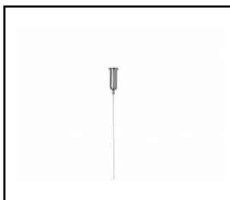
Tube LED EVO suspension cord (266607)