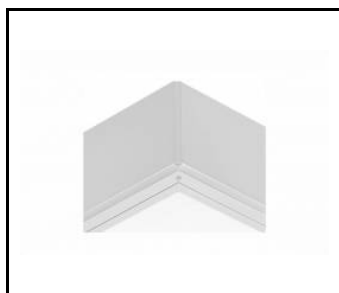
COMPACT LED EVO N IP65