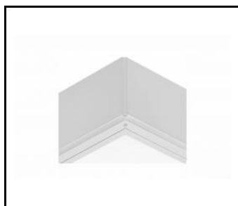
COMPACT LED EVO N IP65