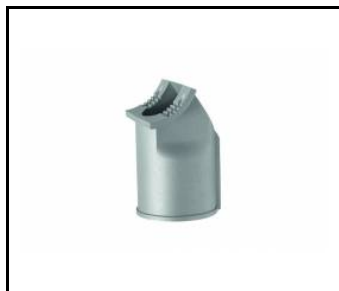
mounting grip 76mm (UL00141)