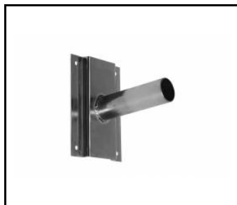
wall holder (galvanized) (314049)