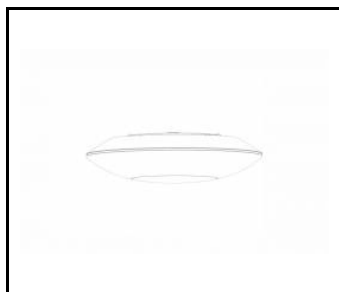
CAPELLA LED EDGE