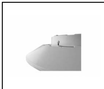
CAPELLA LED BOX ANTYWANDAL