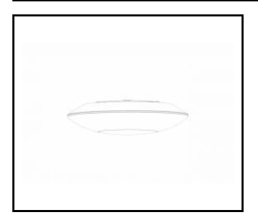
CAPELLA LED EDGE