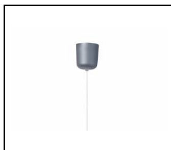
SINGLE SUSPENDED CORD (ROUND BOX) (171635)