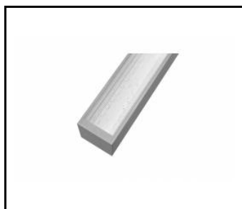
SMART LED EVO - PRZESŁONA PRM