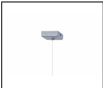
SINGLE SUSPENDEDED CORD (SQUARE BOX) (171642)