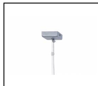
SINGLE ELECTRICAL SUSPENDED CORD (SQUARE BOX) (171574)