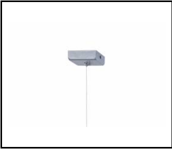
SINGLE SUSPENDE CORD (SQUARE BOX) (171642)