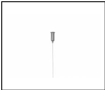
SINGLE SUSPENDED CORD (171512)