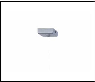
SINGLE SUSPENDE CORD (SQUARE BOX) (171642)