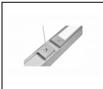
SMART LED EVO - ŚWIATŁO POŚREDNIE, SYSTEM ZWIESZANIA