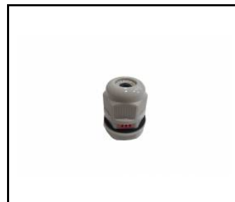
Breathable gland gray M20*1.5 IP68 (16000507)