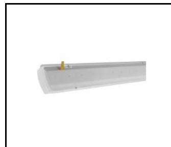
ATLAS LED 1150mm 4500lm 840 - lighting module (952029)