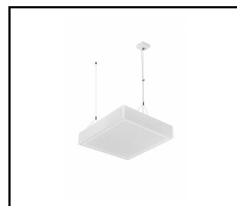
CONTRA LED suspension system 600x600 (374685)