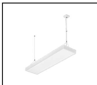
CONTRA LED suspension system 1200x300 (374692)