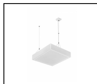
CONTRA LED suspension system 600x600 (374685)