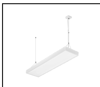
CONTRA LED suspension system 1200x300 (374692)