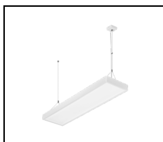
CONTRA LED suspension system CLICK 1200x300 (374692)