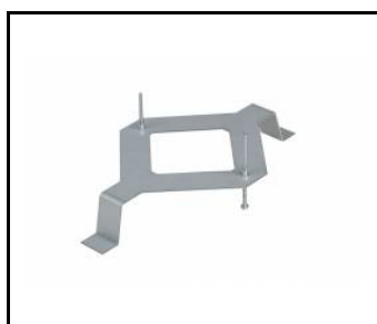
CORAL - flush-mounting support (229763)