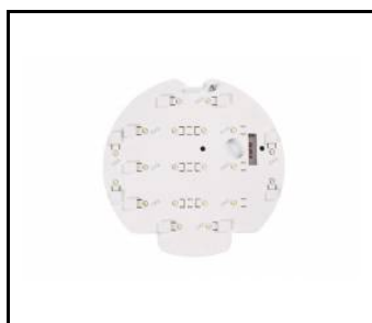
CORAL- 10W service kit 10W 3000K (229831)