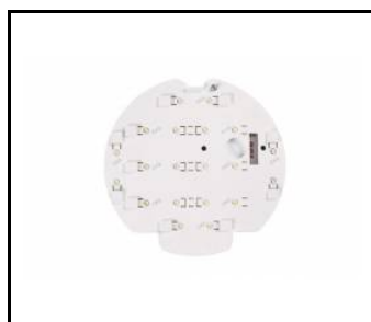
CORAL- 10W service kit 10W RCR 3000K (229848)