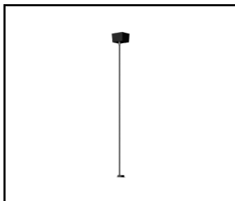
Baris 52 - Dali black power suspension (318078)