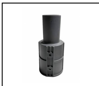
Pole adapter 80/60 ALU (598357)