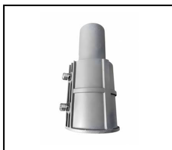
Adjustable bracket Astra LED/Astra LED BASIC aluminium grey RAL 9006 diameter 64 mm Corona 2 LED (UL00214)