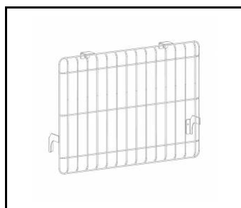
QUEST LED EVO M protective grid RAL7016 (840432)