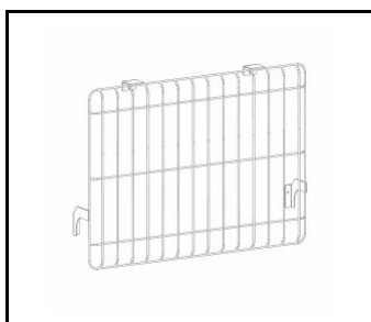
QUEST LED EVO M protective grid RAL9003 (840074)