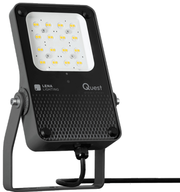
Zdjęcie poglądowe nie uwzględniające zawartych w zestawie uchwytów do montażu natynkowego. Overview photo not including the included surface-mount brackets.