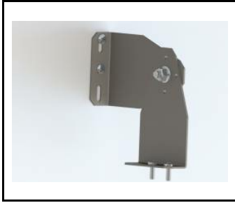
TYTAN LED. ATLAS LED. INDUSTRY LED - adjustable handle (set of 2) (908200)