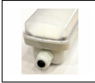
M16 stuffing box plug various PA black M-16 - BPM-21 (60000006)