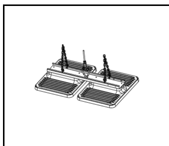
QUEST EVO EVEREST luminaire connector - common suspension RAL7016 (831751)