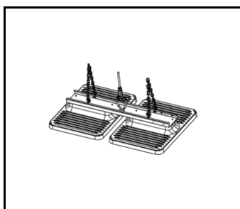
QUEST EVO EVEREST luminaire connector - common suspension RAL7016 (831751)