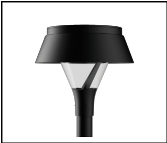
SKVER Hood ULR example 2 RAL9005 (421518)