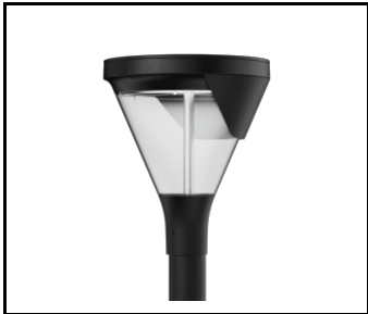
SKVER Backshield RAL9005 (435515)