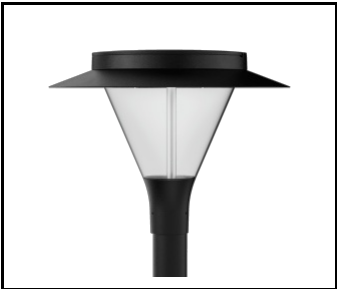
SKVER Hood example 1 RAL9005 (435522)