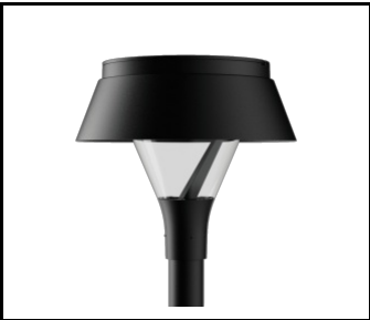
SKVER Hood ULR example 2 RAL9005 (421518)