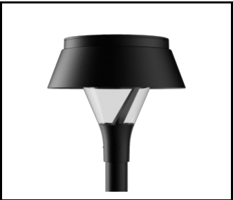
SKVER Hood ULR example 2 RAL9005 (421518)