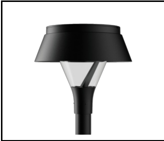
SKVER Hood ULR example 2 RAL9005 (421518)