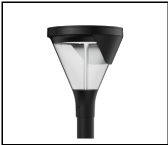
SKVER Backshield RAL9005 (435515)