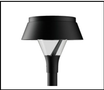
SKVER Hood ULR example 2 RAL9005 (421518)