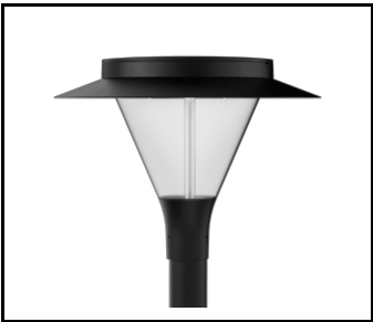
SKVER Hood example 1 RAL9005 (435522)