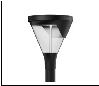
SKVER Backshield RAL9005 (435515)