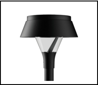
SKVER Hood ULR example 2 RAL9005 (421518)