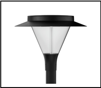
SKVER Hood example 1 RAL9005 (435522)