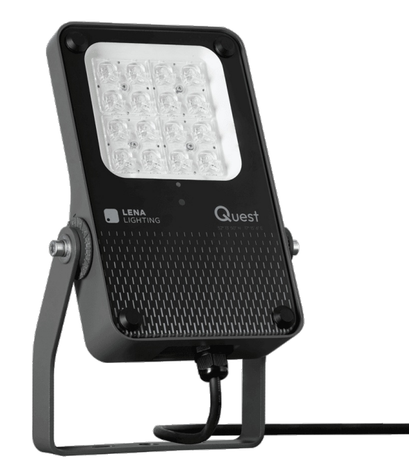
Zdjęcie poglądowe nie uwzględniające zawartych w zestawie uchwytów do montażu natynkowego. Overview photo not including the included surface-mount brackets.