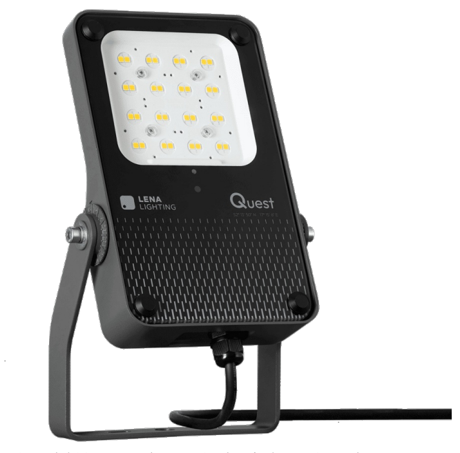
Zdjęcie poglądowe nie uwzględniające zawartych w zestawie uchwytów do montażu natynkowego. Overview photo not including the included surface-mount brackets.