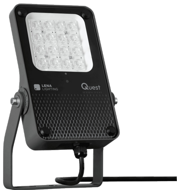
Zdjęcie poglądowe nie uwzględniające zawartych w zestawie uchwytów do montażu natynkowego. Overview photo not including the included surface-mount brackets.