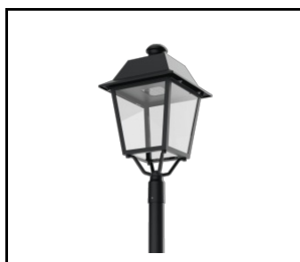
Constelia LED transparent diffuser (809996)