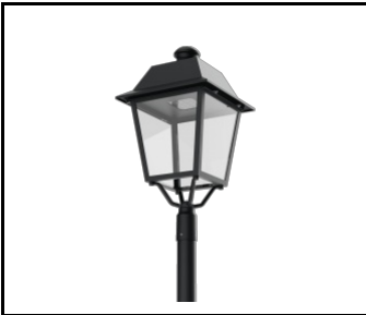
Constelia LED transparent diffuser (809996)

Card creation date: 09 July 2025 The company reserves the right to make design changes or upgrades in the presented product. Product data sheet does not constitute an offer. * Parameter tolerance is +/- 10%