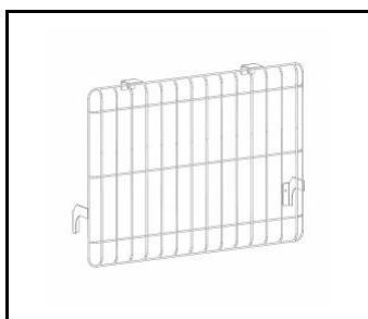
QUEST LED EVO M siatka ochronna RAL9003 (840074)