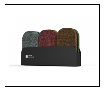
Terra Balance - PET panel colour chart (807015)