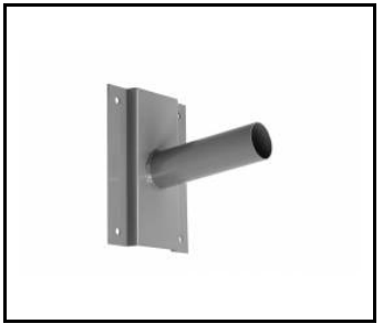
wall holder (galvanized) (314049)