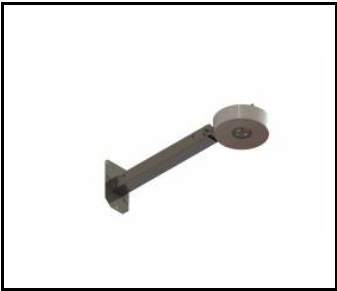
DOT CS galvanized steel arm (545672)