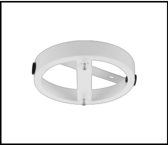
Ceiling spacer DOT white matt (551161)